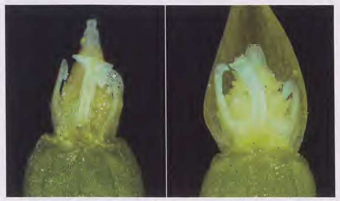
Figure 3. Prasophyllum abblittiorum flower with tepals removed showing two forms of the anterior lobe of the column.

Terrestrial tuberous herb usually growing singly. Tubers sub-globose to ovate forming a current and replacement pair. Current year's tuber 6–7.5 mm wide, 7–12 mm long in fresh specimens seen. Leaf of fertile plant (55–)70–200(–250) mm tall, erect, acicular with a long fine apex, (1.5–)2–5(–7) mm in diameter at the widest point, hollow, glabrous, narrower in infertile